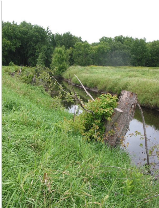
Recent cutting of large trees from dike slopes on Mead prevented potential dike damage from wind pushing a tree over and taking part of the dike with it.

Lastly, the DNR's Wildlife Program is implementing a new strategic plan. This plan will define and direct priority operations of the statewide wildlife program for the next five years.